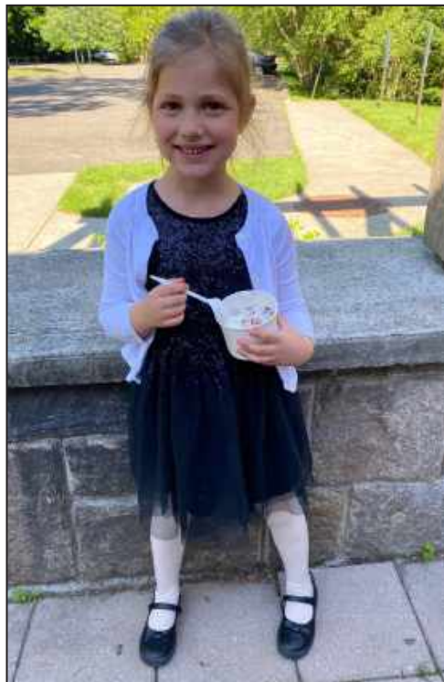
It was wonderful seeing many of our B'Yachad students enjoying time together while celebrating Shavuot at this summer's Ice Cream Meet Up.